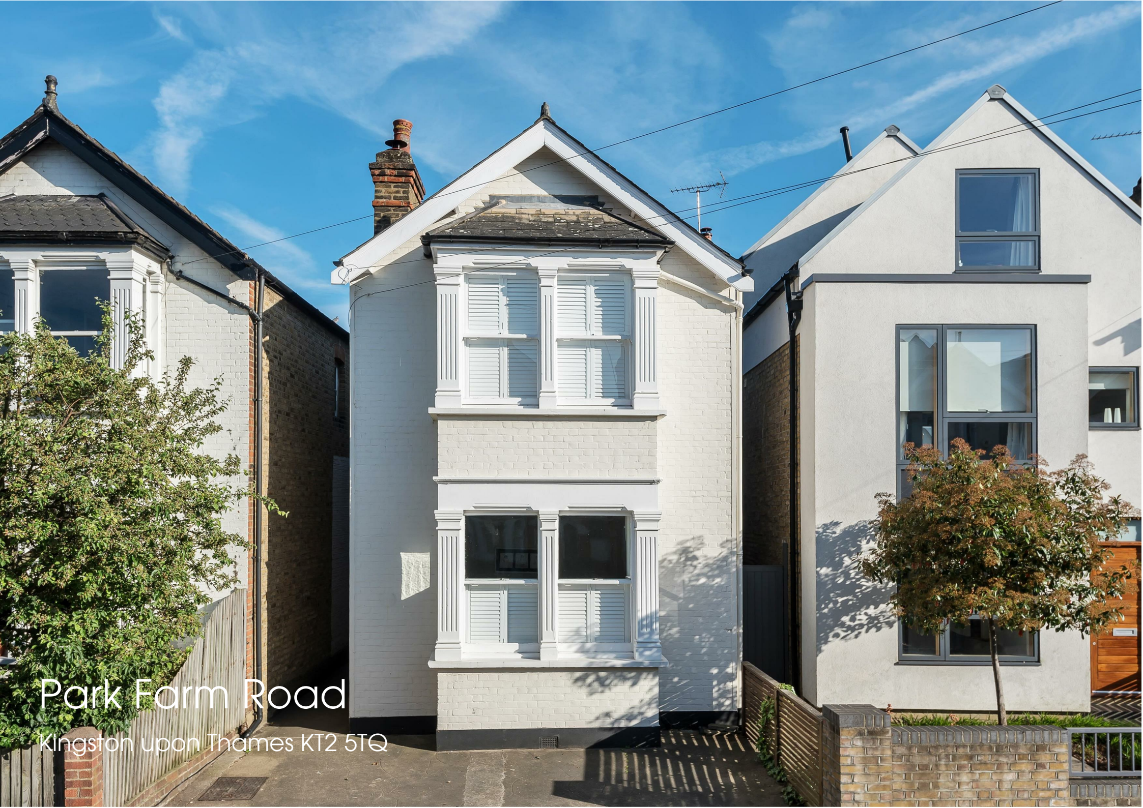
Park Farm Road Kingston upon Thames KT2 5TQ

34 Richmond Road Kingston upon Thames Surrey KT2 5ED www.gibsonlane.co.uk Tel: 020 8546 5444